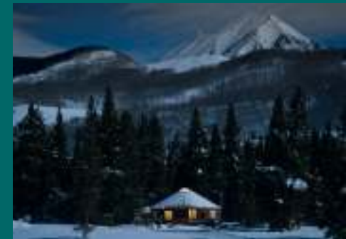
Monthly Full Moon Dinners and Sunday Brunches made our Magic Meadows Yurt a popular destination this year for locals and out-of-towners alike.