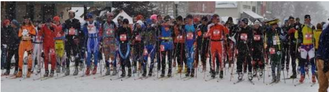
The start of the 23rd Annual Alley Loop Nordic Marathon.