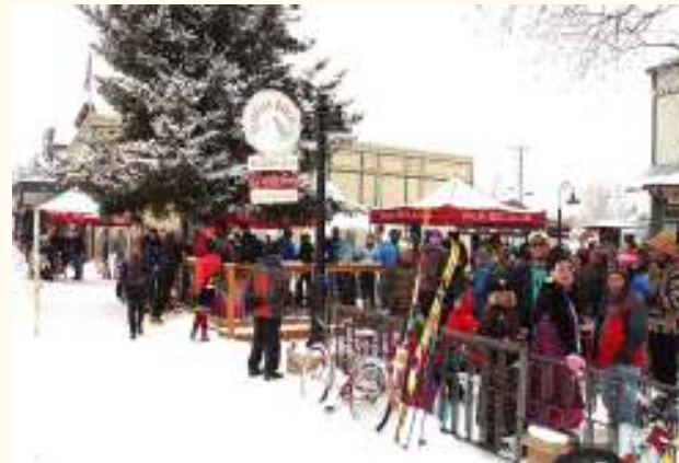
The Alley Loop was like skiing through a snowglobe this year, but the weather didn't dampen the spirits of the racers or the revelers, pictured here at the Brick Oven Pizzeria.