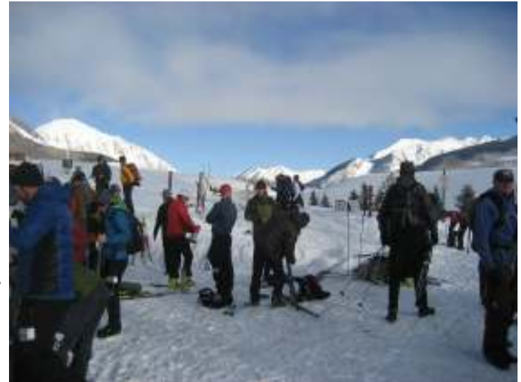
The day of the Super Tour dawned thin clouds shrouding the distant peaks, and turned into a glorious sunny day with a few inches of fresh powder from the night before.

Another great event in March was the Progressive Bonfire Dinner. This annual fundraiser for the Junior Nordic team drew 106 skiers and snowshoers for four courses of gourmet local food served beside roaring bonfires.