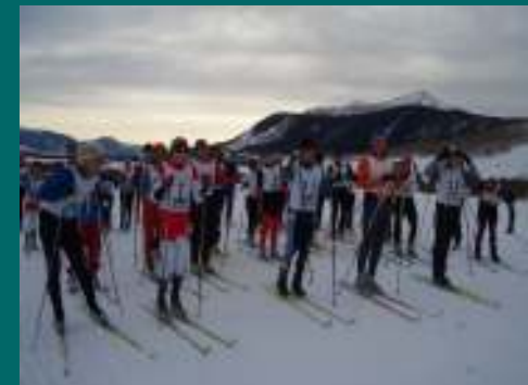
Another awesome season of Citizens races got us all in shape for the Alley Loop and kept local rivalries alive.